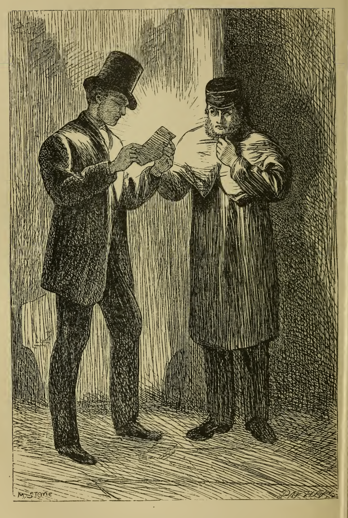
"TON'T GO HOME!"